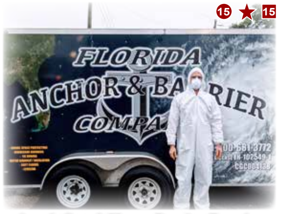
Insulation & Vapor Barrier Repairs Soft Floor Repairs & Laminate Flooring

Wishing you good health and safety, The Florida Anchor & Barrier Team